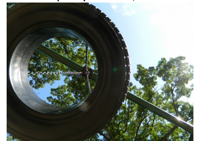
Samantha Nicolich's worm's eye view of a tire swing

to turn in another. The first photography assignment this year was designed to train the student's eye and offer a new perspective of the world. Students took photographs from two different perspectives, a worm's eye view (making the world look massive) and a bird's eye view (making the world seem tiny). The results were outstanding!