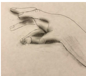
Emma Benson's initial hand drawing attempt

examining all of the intricate details of their hand and drawing their hand using realistic value. Throughout the past few weeks students were instructed to break down their complex hands into more manageable shapes such as 3D rectangles and squares. From there students have been busy learning multiple shading techniques and discovering the wonders of the paper tortillon (which is an instrument used for blending pencil lines). Every student has been working hard and the drawings reflect their hard work.